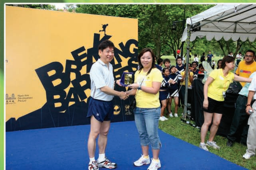
Kah Motor Co Sdn Bhd

Singapore Technologies Telemedia Pte Ltd & Ngee Ann Development Pte Ltd.