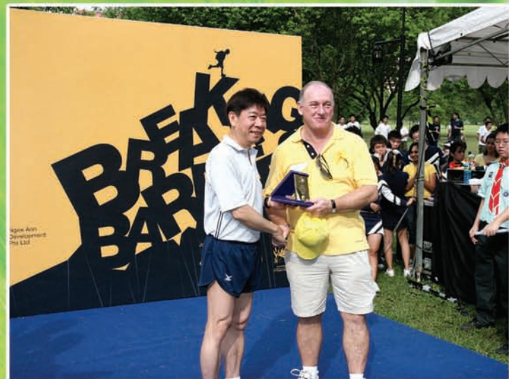
Senoko Power Ltd