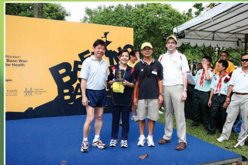
National Electricity Market of Singapore (NEMS)