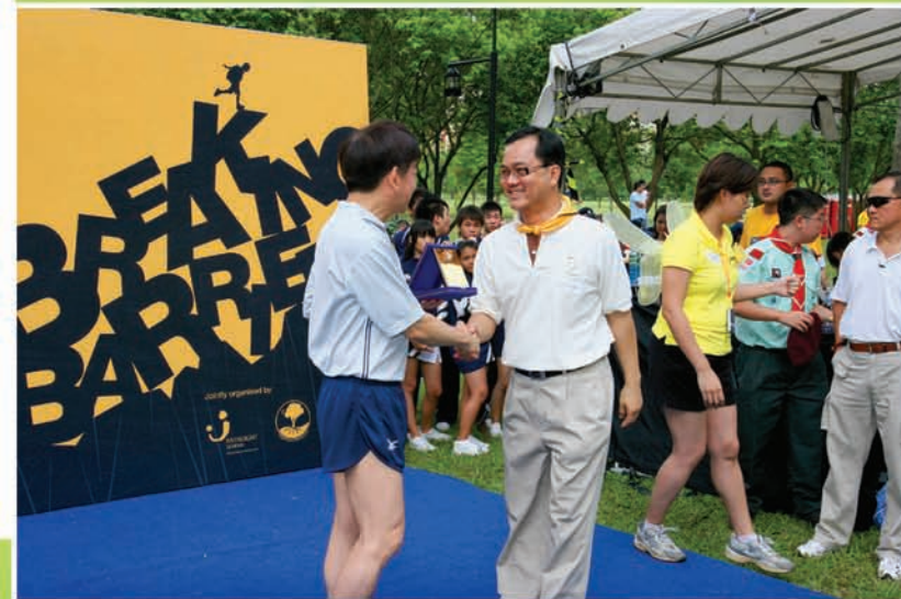
Super Bean International