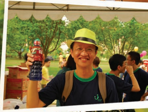
Many heeded our call to come in something yellow, brightening up the place with joy and smiles.