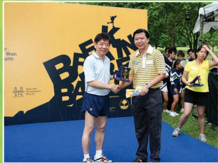
Rajah & Tann Advocates & Solicitors