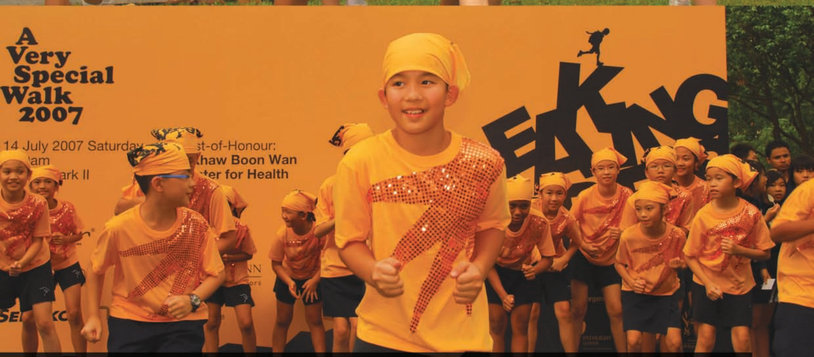
The crowd of a thousand or more was charmed by young Pathlighters & kids from Dance Spectrum International, who danced to the beat of "Walking on Sunshine" ...