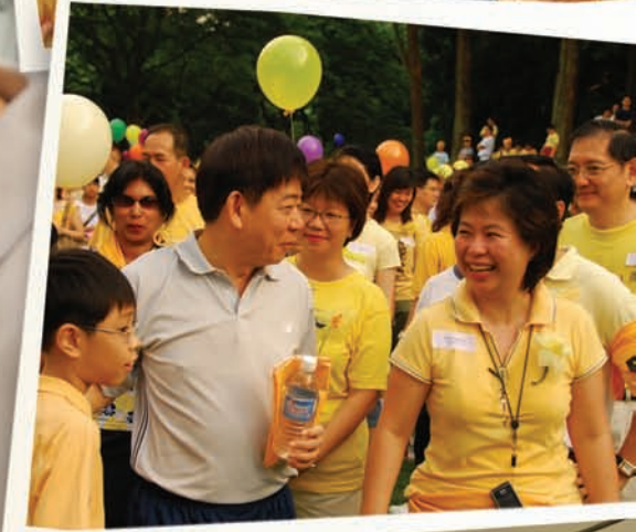
The weather was good, the people, in the mood.